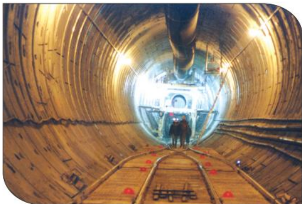
Figure 2. St. Clair river tunnel precast tunnel lining segments (Dang Van Kien et al, 2019).

A various numbers of research have been conducted to examine the effects of use of fly ash as additive in cement, admixture in concrete and as replacement of cement in concrete. The compressive strength of concrete was checked by replacing different proportions of cement with suitable quantities of fly ash and the results have been found most effective and applicable. Incidentally most of the research works have been conducted only for a limited percentage of cement replacement that too for a lower grade of concrete. It is, therefore, necessary to conduct an extensive research on compressive strength of different qualities of concrete as well as different proportions of fly ash at different curing periods. Here in below the various methods of using the fly ash as a cement replacement in concrete is discussed vividly. This paper presents the effect of fly ash replacement on compressive strength and flexural strength of concrete along with the slump and other fresh and hardened properties. A comparative cost investigation with making concrete insert plate of SVP steel frame in underground mines has presented.