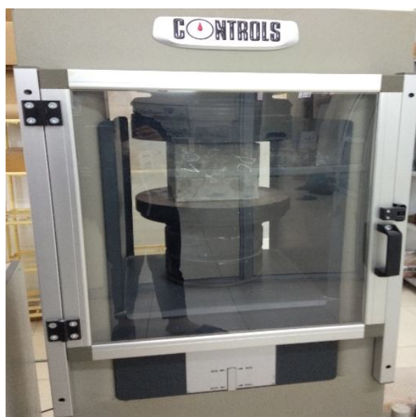
Figure 5. Testing of concrete cube in Advantest 9 (control- Italy) system of HUMG.