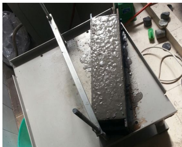
Figure 4. Specimen prepared for test.