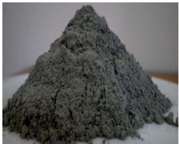
Figure 1. Sample of fly ash.