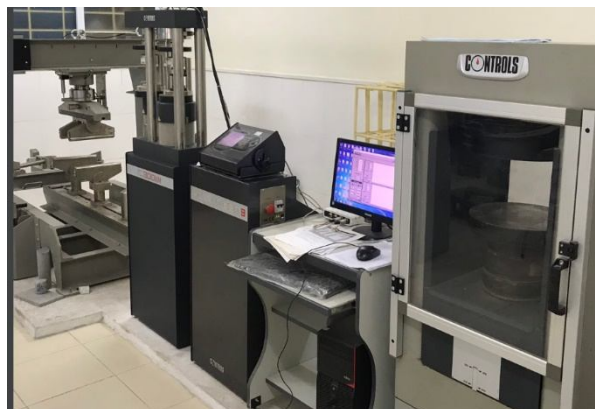
Figure 3. Advantest 9 (control- Italy) system of HUMG.

Cement: Ordinary Portland cement (Ambuja Cements of 53 grades) was used having specific