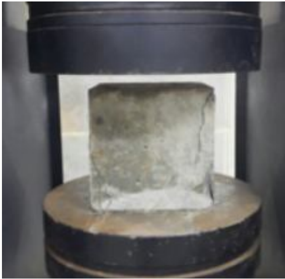
Figure 6. Compressive strength test at HUMG.